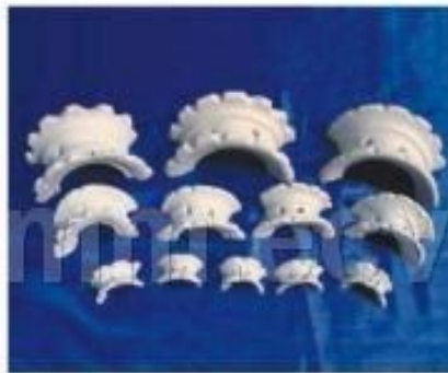
Super Intalox 异鞍环 (XXD703)