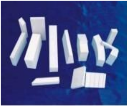
Acid & Heat Resistance brick, Plate and Pipe 耐酸砖、板、管 (XXD6)