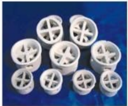
Cascade Mini Ring 阶梯环 (XXD706)