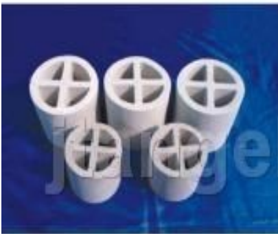
Cross Ring 十字环 (XXD702)