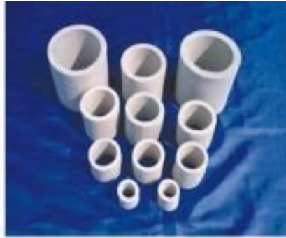
Rasching Ring 拉西环 (XXD701)