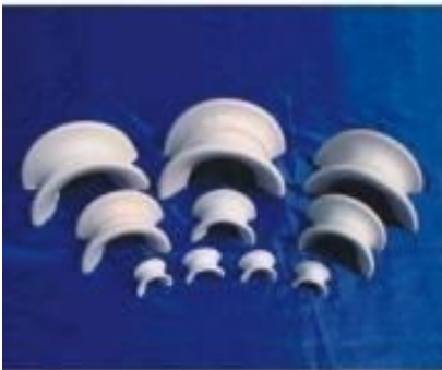
Intalox Saddle 矩鞍环 (XXD705)