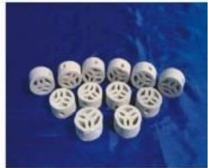
Tri-Y Ring 瓷三丫环 (XXD707)