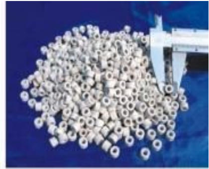
Rasching Ring 拉西环 (XXD701-1)