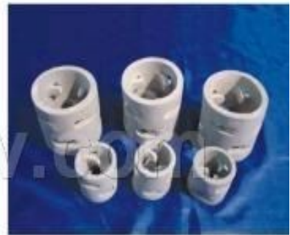
Pall Ring 鲍尔环 (XXD704)